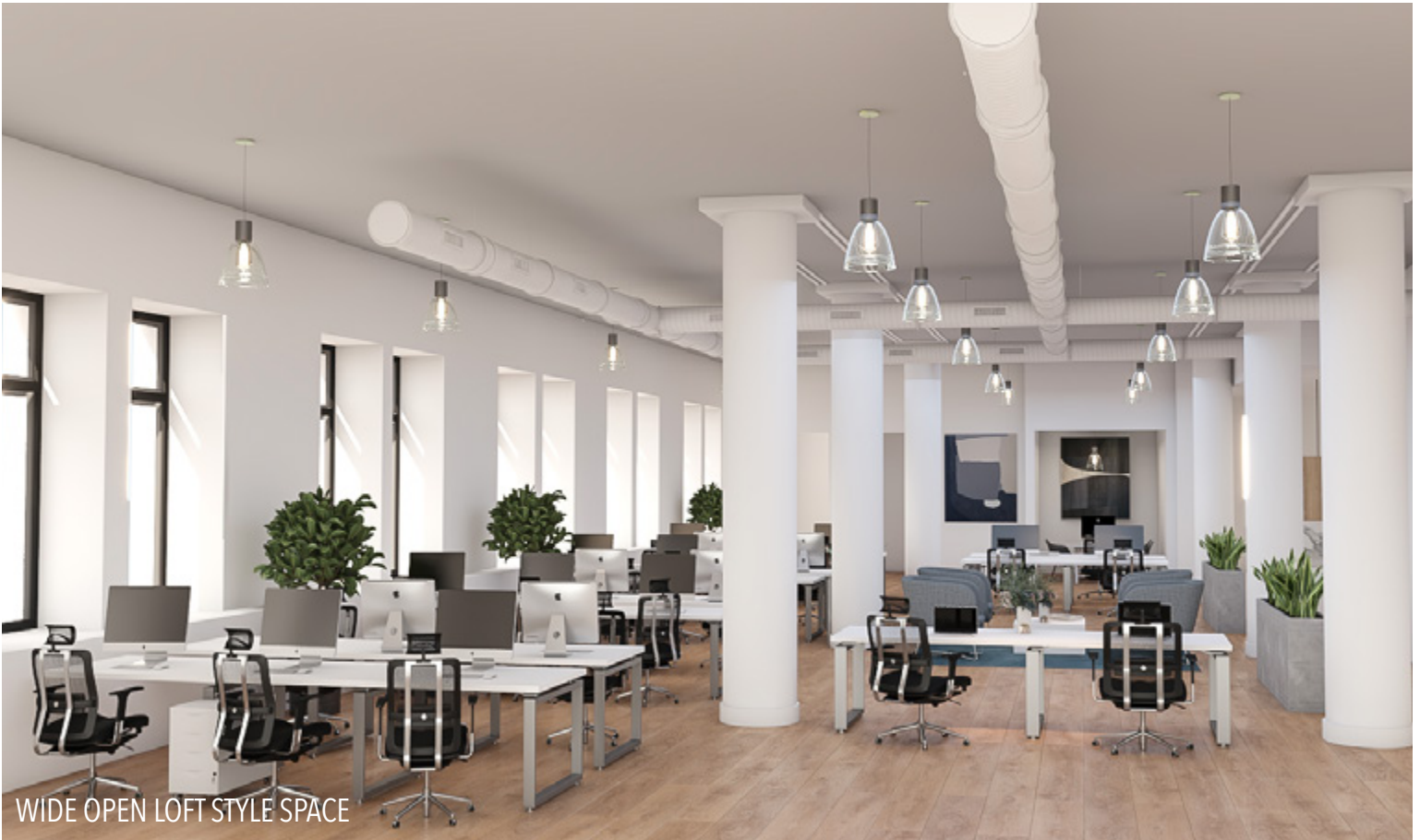
WIDE OPEN LOFT STYLE SPACE